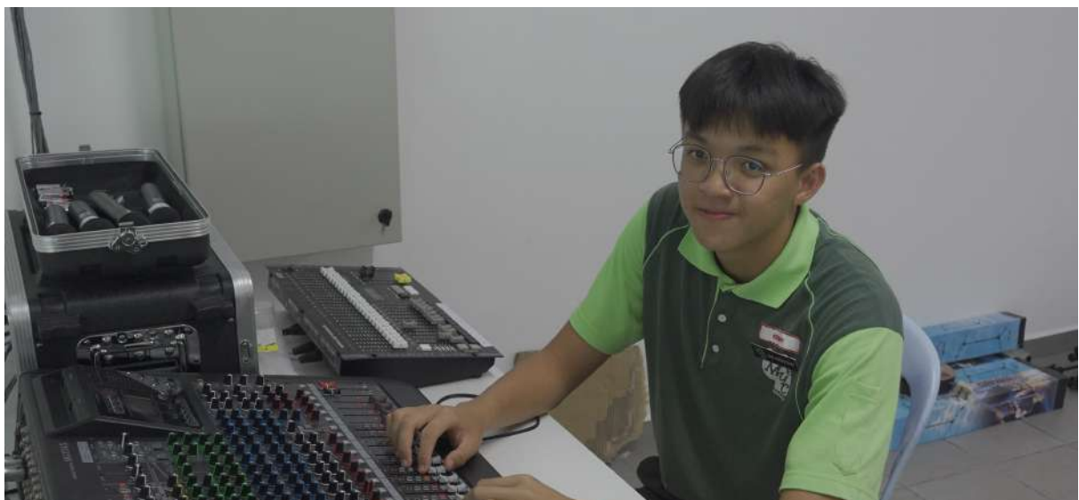
SOUND SYSTEM BOY