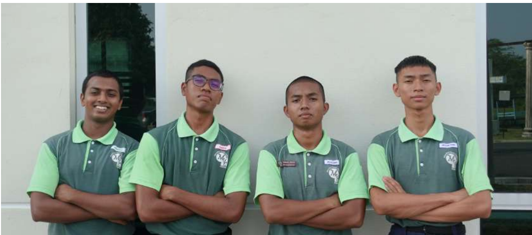
ENVELOPE FOLDING BOYS