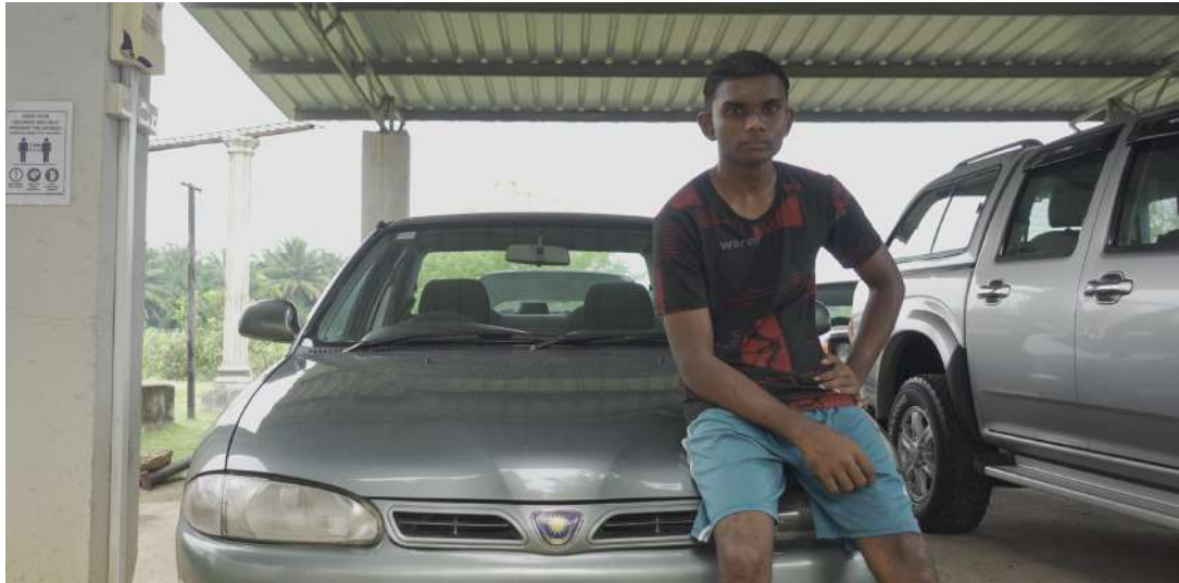
CAR WASH BOY