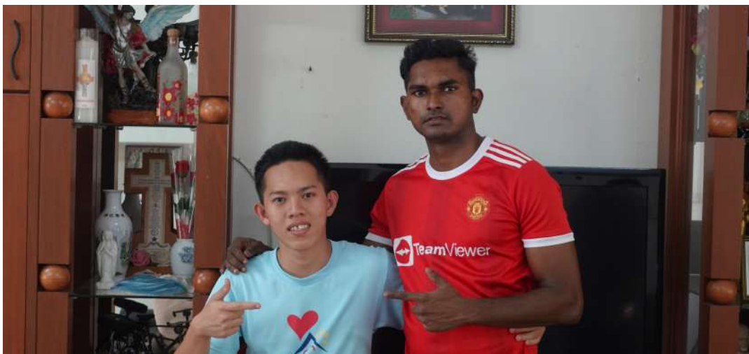
BROTHER'S QUARTERS BOY