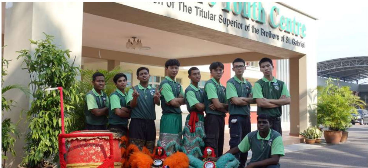
LION DANCE BOYS