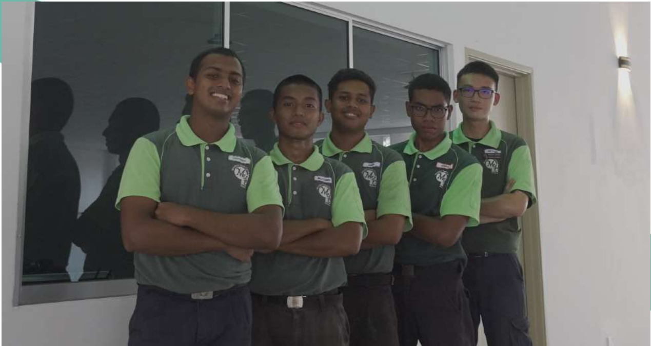
HEAD QUARTERS PREFECTS